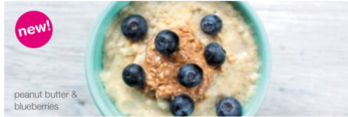
peanut butter & blueberries

plain or agave 2.39 banana & sultanas 2.79 peanut butter & blueberries 2.79